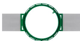
Use Pre-Construction Bracket EL-PCB-IC-6