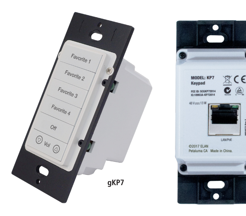
The ELAN gKP7 is international voltage compatible.