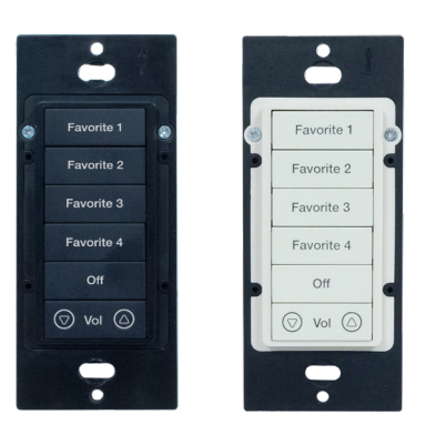
Comes in white with optional black or light almond bezel kit.