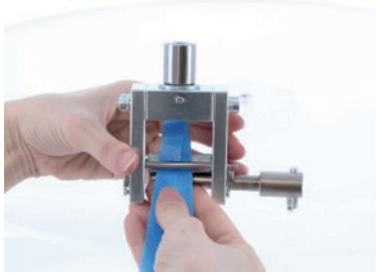
Fold the sample and insert it