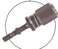
HIOS to HEX ADAPTER SEE PAGE 01.45