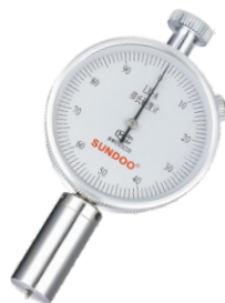
Shore A Durometer